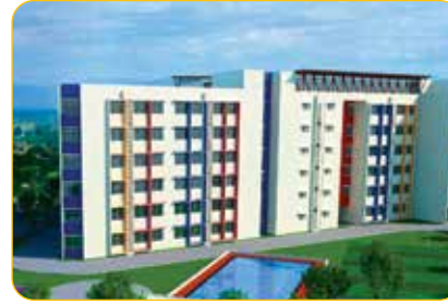
HSR LAYOUT CAMPUS