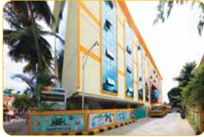
BTM LAYOUT CAMPUS

EXPLORE OUR CAMPUS AND LEARN HOW WE CAN SHAPE YOUR CHILDS' FUTURE