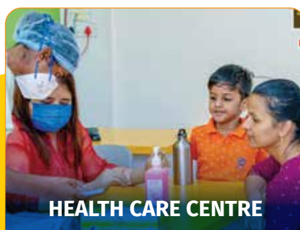
HEALTH CARE CENTRE

We maintain a ratio of 1:14 so that every student gets the attention they need to strive. In case of specially-abled students, they are taken care of by an individual teacher all the time.