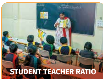
STUDENT TEACHER RATIO

The PLC Staff also provides guidance and counselling to parents on effective parenting styles. The PLC Staff implements vocational guidance programme for high school students.